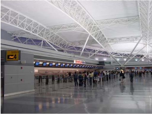
John F. Kennedy International Airport Jamaica, New York

John F. Kennedy International American Airlines Terminal Project Jamaica, New York