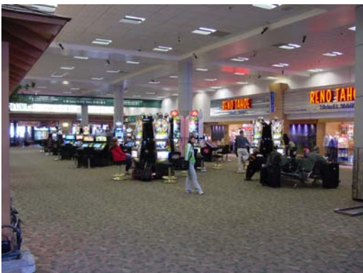
Reno-Tahoe International Airport Reno, Nevada

Philadelphia International Terminal A Philadelphia, Pennsylvania